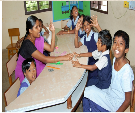
At her Classroom