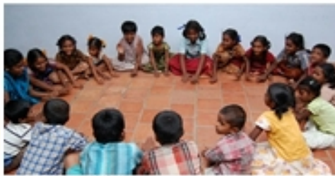
EVENING STUDY CENTRE